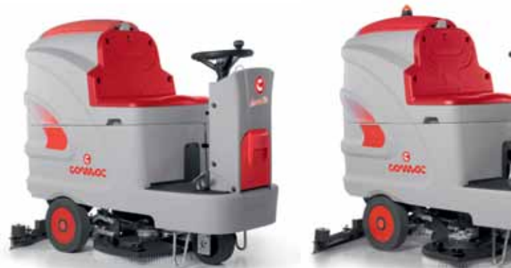
Innova 60 B

The brush head and the squeegee are lowered/raised by simply using two levers