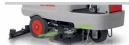
Innova 70 S

Innova 65/75/85 is equipped as standard with a device that allows the adjustment of the working width from 65 to 85 cm. (for further information, please contact Comac Technical Assistance Service)