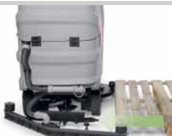
Automatic squeegee uncoupling when accidentally impacted