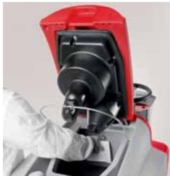
Easy and complete tank sanitizing

Easy battery charging thanks to the possibility of an onboard battery charger (on request)