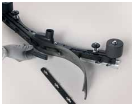
Easy rubber replacement without any tools on the exclusive Comac squeegee (Patent Pending)