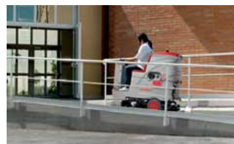
Low center of gravity for optimum stability. Capable of ramp gradients up to 18%