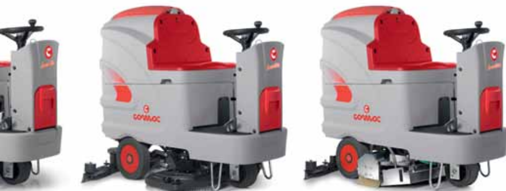
Innova 100 B

A simple device (optional) allows the quick filling of the tank with clean water without the presence of the operator