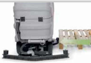
Automatic swing-in of the brush head when accidentally impacted (Innova 65/75/85/100 B / M)