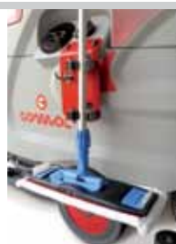
Innova 60/65/75/85/100 B / M - 70 S is available on request with a support for your manual cleaning kit, that allows to complete the cleaning operation